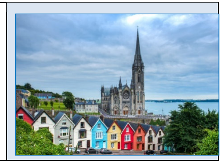
Cobh, a tourist seaport town near Cork associated with Titanic's fateful voyage...