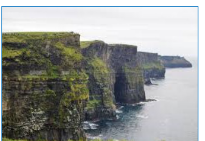
Cliffs of Moher, one of the most popular tourist destinations in Ireland visited by almost one million visitors each year...