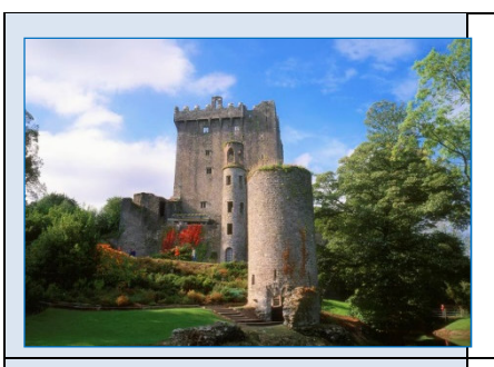
Blarney castle and the Blarney stone, kissing which is said to give the gift of eloquence...